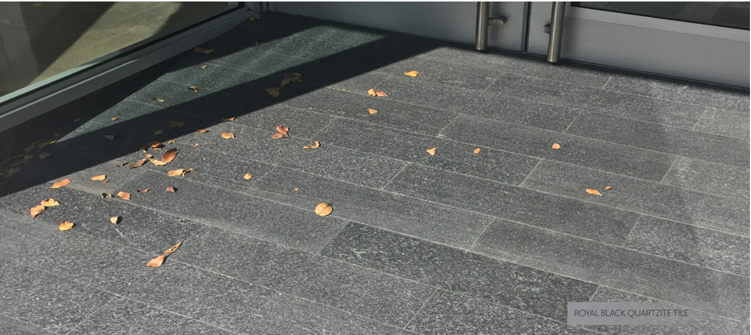
ROYAL BLACK QUARTZITE TILE

Note: natural stone varies in color, tones, markings and texture due to its geological composition, samples can only give a reflection or idea of the formation, veins and texture. Any variations must be accepted as inherent features of all natural stones.