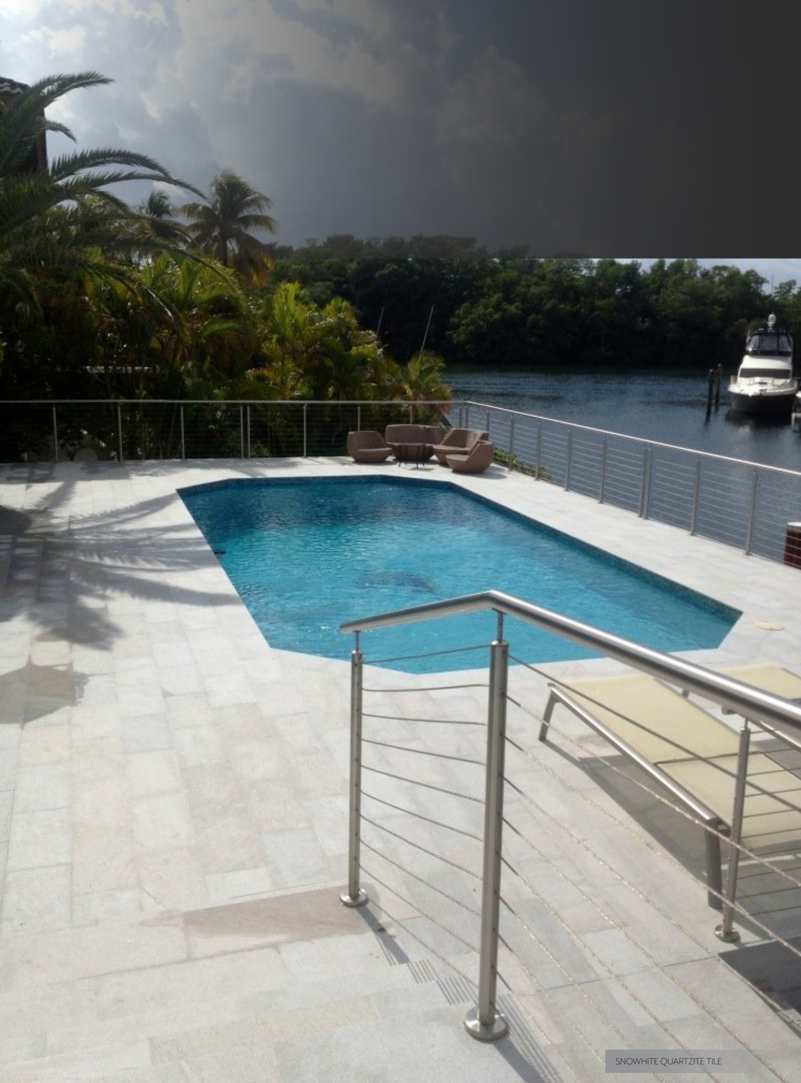
SNOWHITE QUARTZITE TILE