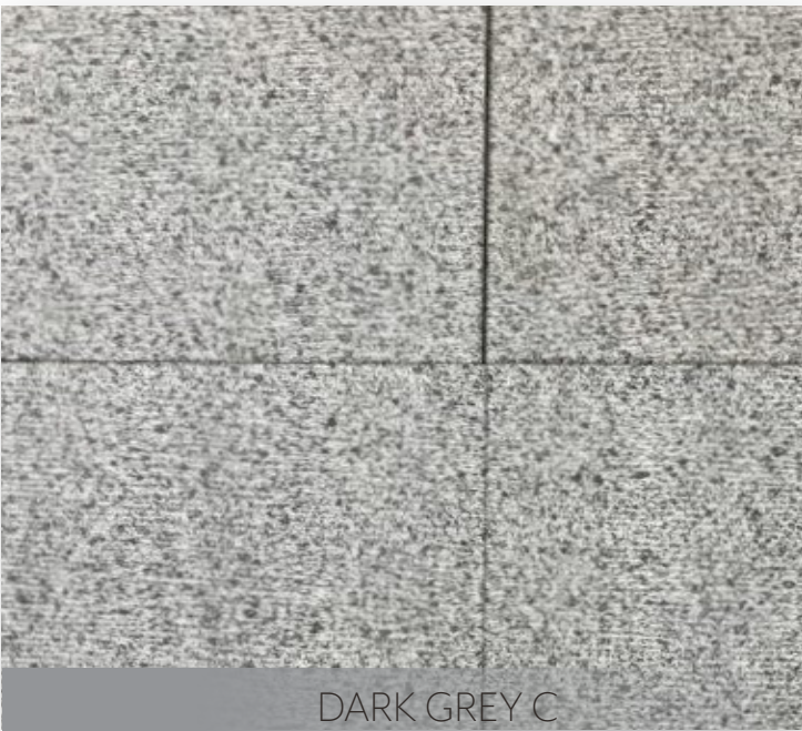
DARK GREY C