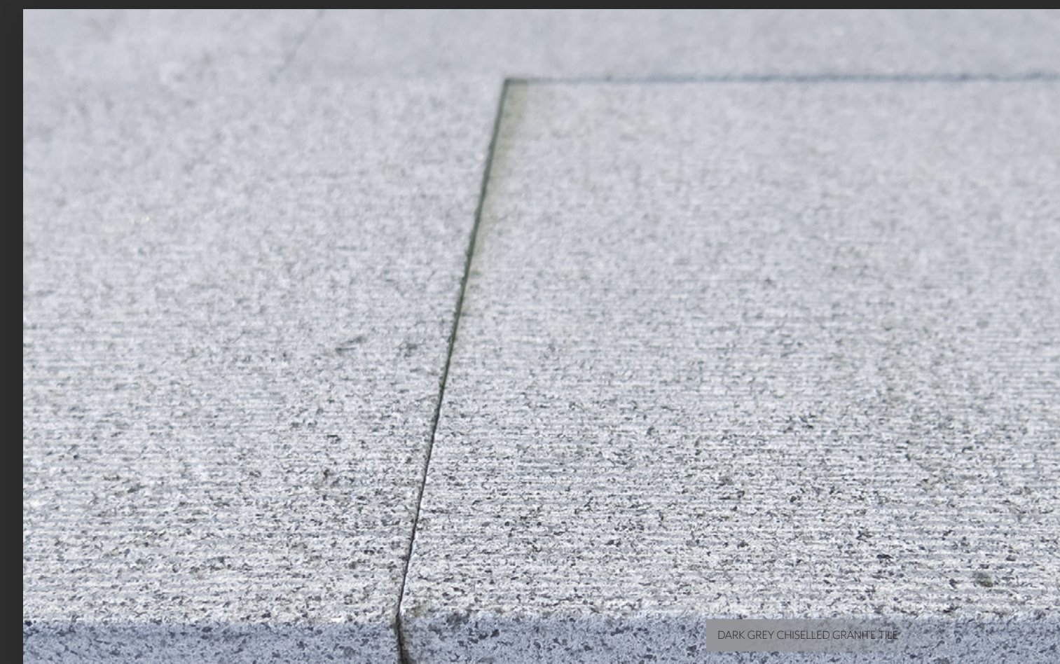
DARK GREY CHISELLED GRANITE TILE

We offer an exquisite and exclusive collection of Granite Tiles in different finishes as Polish, Honed, Sandblasted, Grooved, Brush, Bush Hammer and others as well as many colors.