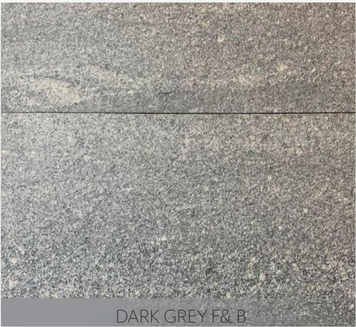
DARK GREY F&B